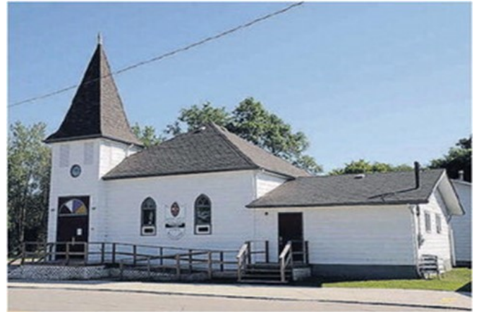
Clandeboye Winnipeg Beach United Church

“Not greed and power, not accumulation of wealth, not oppression of others who are different in colour or sex or occupation but love and respect and caring.”