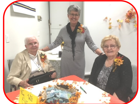
UCW Fall Tea; Oct. 5th, 2017

To unite women of the congregation for the total mission of the church and to provide a means through which we may express our loyalty and devotion to Jesus Christ in Christian witness, study, fellowship and service.