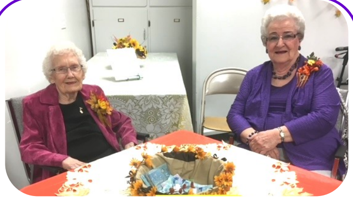
Thanksgiving tea 2017

UCW January Birthdays No one in January!!