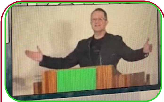
January 15th You Are the Light of the world

Sending our thoughts , prayers and HUGS to all who are experiencing health issues