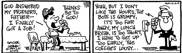
TRIUMPH OF THE CROSS

Their names are on the back page of this newsletter.