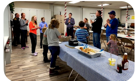
Crafts, Singing & Dancing, Bible Story & FOOD!!