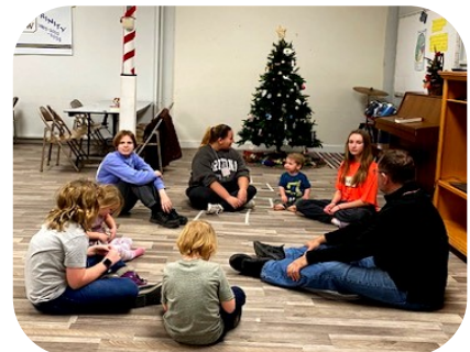
Come on Out!! Have FUN