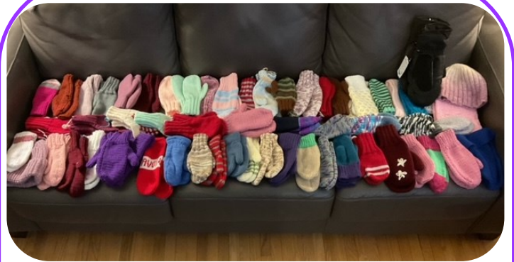
TRINITY 55 PLUS GROUP.... MISSION FOR MITTENS...

THANK YOU TO EVERYONE FOR YOUR CONTINUED SUPPORT FOR OUR SCHOOL CHILDREN WITH MITTENS, AND MORE, FOR ANOTHER COLD WINTER. DELIVERED TO SCHOOLS AND ALWAYS SO GRATEFULLY RECEIVED AND APPRECIATED.