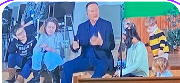
On a very cold Sunday, January 19th our junior Sunday school learned about shining their light! Bumble Bee Benny moves easily in and out of the action.