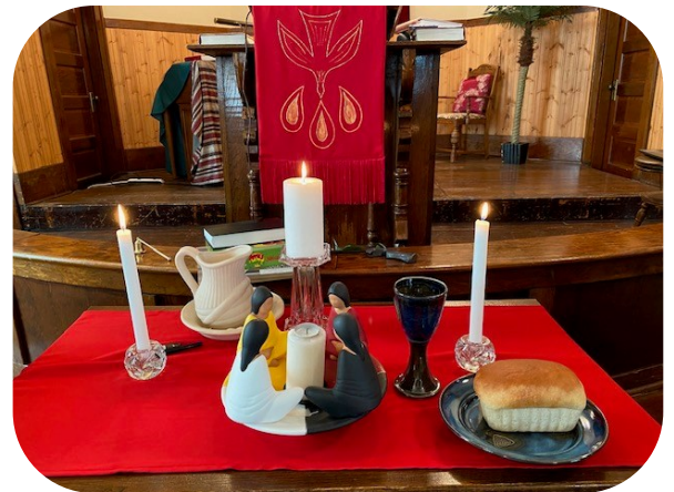
The table is set

Thanks to Alan Silvius for finding this very appropriate gift to exchange.